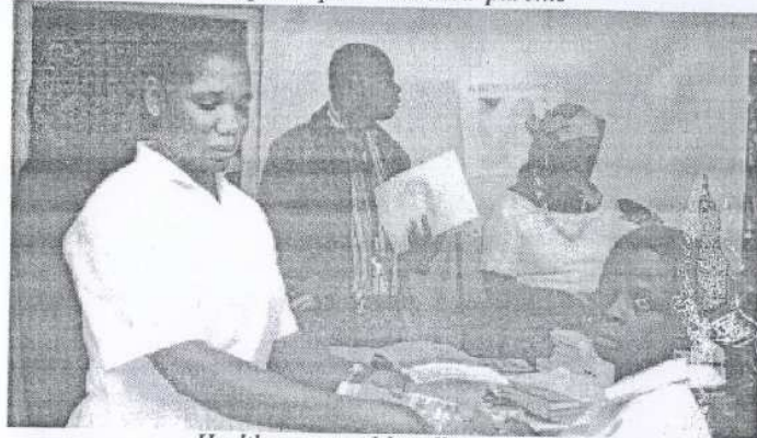
Health personnel handing over gifts