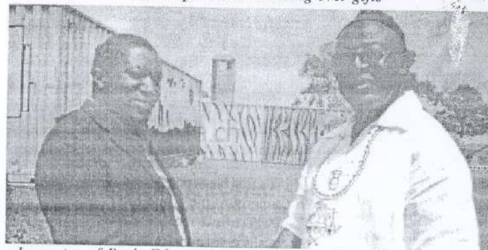
Inspector of Basic Education congratulating CAMFRUD President