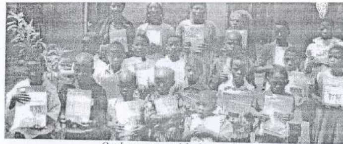
Orphans pose with their parents